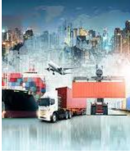
Supply Chain Disruptions / Inflation