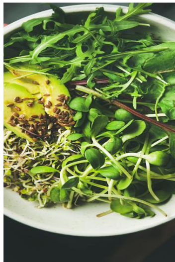
Plant-Based / Healthy Ingredients