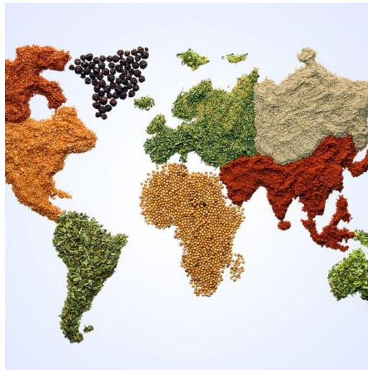
Global Cuisine / Bold Flavors