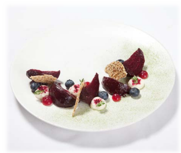
Our Original Beet Salad

We originally developed this hors d'oeuvre as a Sit-Down salad. We use many different sources for inspiration when we are developing new menu items, and in this case, it was the publication Art Culinaire. From here we developed and later introduced our new salad, which would be sold during the Fall/Winter season of 2015.