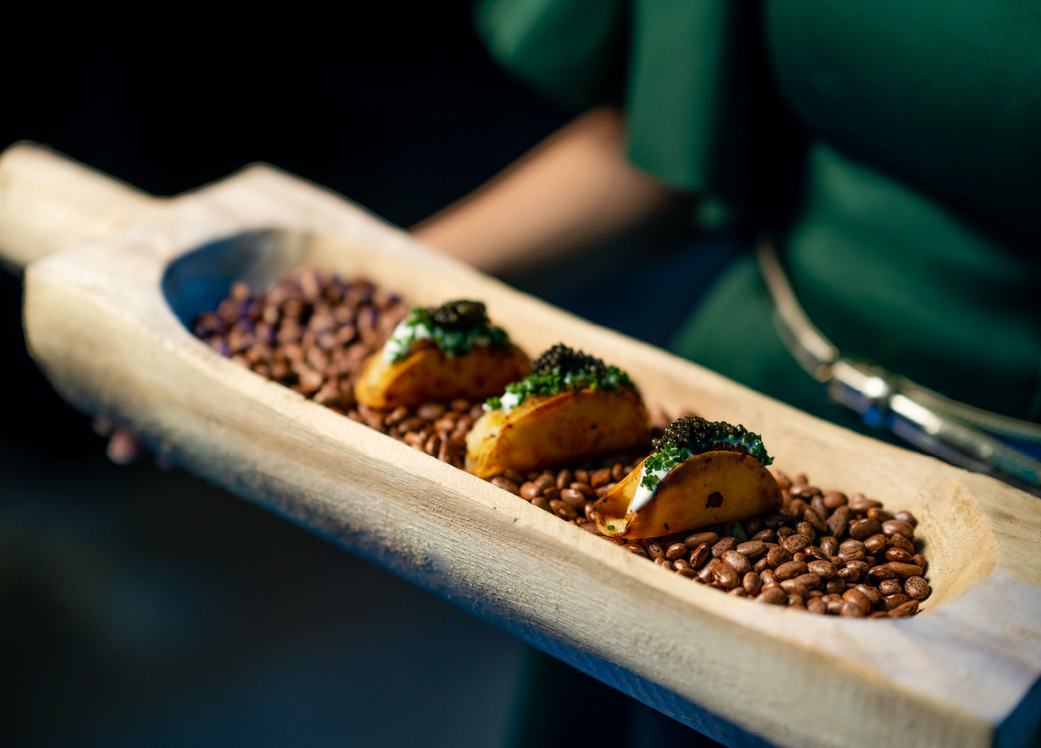
BEST HORS D'OEUVRE | CAVIAR POTATO TACO